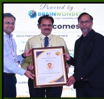
'PRINCIPAL OF THE YEAR' AWARD

“Let our advance worrying become advance thinking and planning.”