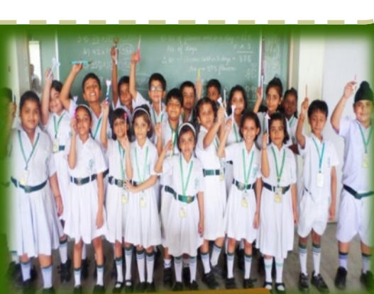
ECO-FRIENDLY PAPER PEN MAKING ACTIVITY