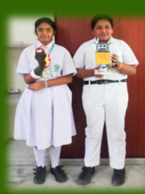
PORTRAIT MAKING ACTIVITY